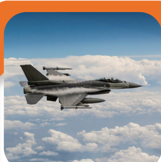
Aerospace & Defense